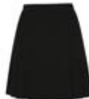
Girls School Pleated Black Skirt