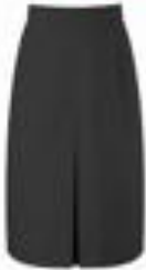
Banner Thornton Front Pleat Black