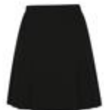
Older Girls School Pleat Black Skirt