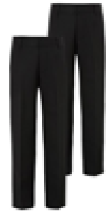
Boys Regular Fit Black trousers