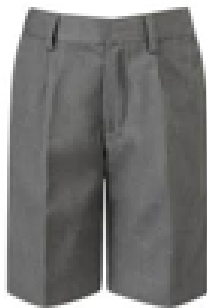
Banner Bermuda Trousers Black (Summer Term)