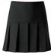
Banner Charleston Pleated Black